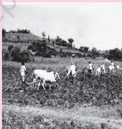
Fig. 1.1 India's agricultural stagnation under the British colonial rule

The French traveller, Bernier, described seventeenth century Bengal in the following way: "The knowledge I have acquired of Bengal in two visits inclines me to believe that it is richer than Egypt. It exports, in abundance, cottons and silks, rice, sugar and butter. It produces amply — for its own consumption — wheat, vegetables, grains, fowls, ducks and geese. It has immense herds of pigs and flocks of sheep and goats. Fish of every kind it has in profusion. From rajmahal to the sea is an endless number of canals, cut in bygone ages from the Ganges by immense labour for navigation and irrigation."