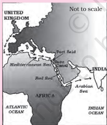
Fig.1.2 Suez Canal: Used as highway between India and Britain

Various details about the population of British India were first collected through a census in 1881. Though suffering from certain limitations, it revealed the unevenness in India's population growth. Subsequently,