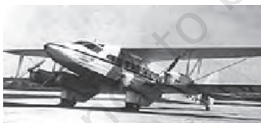
Fig.1.5 Tata Airlines, a division of Tata and Sons, was established in 1932 inaugurating the aviation sector in India

➤ There is a perception still going around that in many ways the British administration in India was quite beneficial. This perception needs an informed debate. How would you look at this perception? Argue this out in your class—'Was the British Raj good for India'?